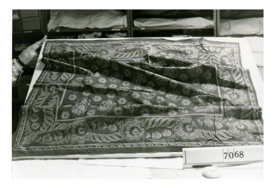
Figure 4. Scarf, possible Tignon, 38–3/4 in x 36 in, ca. 1850.

By probing the cryptic possibilities of such objects, the diverse lives of women of colour can be imaginatively reassembled and resurrected from archival silence. The imaginative and creative "afterlives" of these artefacts reveal how they were able to carve out personal