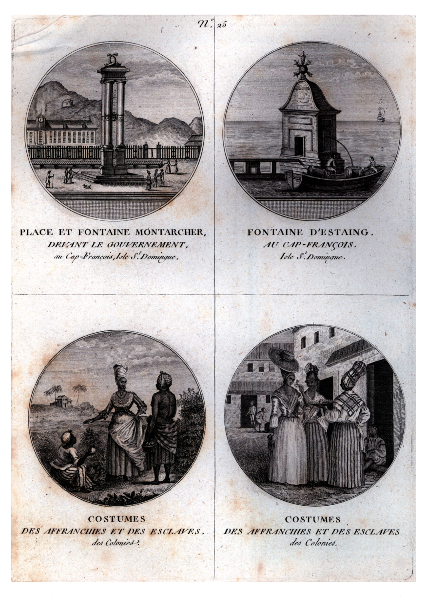
Figure 2. Plate from Nicolas Ponce, "Recueil de vues des lieux principaux de la colonie françoise de Saint-Domingue," in Médéric Louis Élie Moreau de Saint-Méry, Loix et constitutions des colonies françoises de l'Amérique (1791).

These complexities were magnified by the French engraver Nicolas Ponce in a series of engravings that he produced for Moreau de Saint-Méry's Receuil de vues des lieux principaux de la colonie françoise de Saint-Domingue (1791). Like Brunias, Ponce focalised on the dress and bodily adornments of women of colour in order to illustrate his point. In an engraving from Plate 25 entitled "Costumes des Affranchies et des Ésclaves des Colonies"