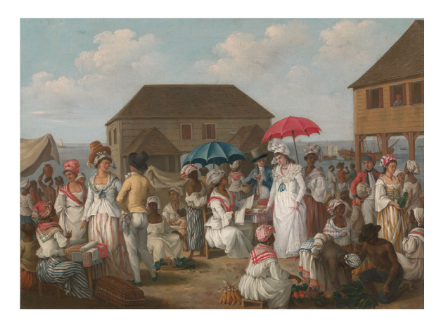
Figure 1. Agostino Brunias, Linen Market, Dominica (circa 1780), oil on canvas (50 x 69cm).

colonial marketplace, where racial and gendered identities were frequently contested through the exchange and acquisition of material goods.<sup>24</sup> Brunias's painting shows that, within the colonial linen market, fabric functions as a form of social currency, conferring status and power on the women who operate within it. The conditionality of this power is nevertheless compounded through the optics of stratification created by Brunias, who situates the vendors below the visual level of the "consumers" reflecting what art historian Kay Dian Kriz calls a "hierarchically ordered community of people of color."<sup>25</sup> The force of (light-skinned) female agency within this nexus is reinforced by the strategic placement of white men, who frame their interactions as observant bystanders or as chaperones who carry the purchases of their presumed paramours.